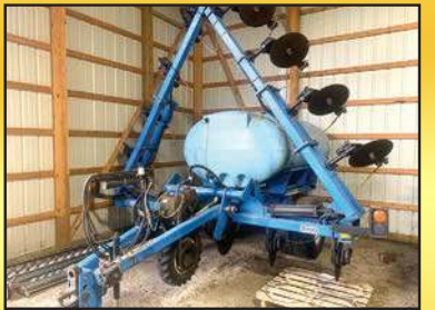
DMI 2800 13 knife liquid fertilizer tool bar, John Blue pump, 800 gallon tank, 14L-16.1, SN: JFH0010955