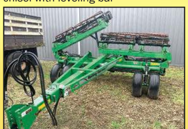
2013 Unverferth 1225 , 26' double rolling basket with spike harrow, SN: