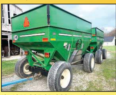
(2) J&M 385-SD 380 bu. Side dump gravity box on J&M gear 385/65 22.5, SN: 34429/14236 & 34420/14356