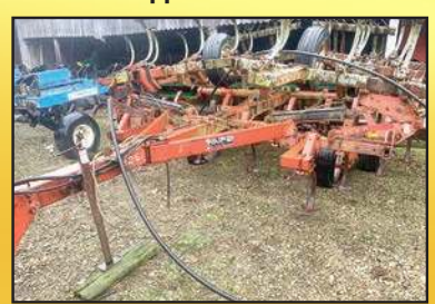
White 226 Field Cultivator, 24', with single leveling bar; JD single fold disk, new blades