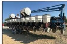
KINZE 3600 16/31 PLANTER , corn and bean meters, no till coulters, in furrow fertilizer on corn rows, 2-150 gal. poly fert. tanks, rubber closing wheels, SN-615734