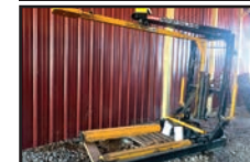
AG WRAP for 3 pt. hay wrapper very good cond.