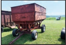
KILLBROS GRAVITY WAGON