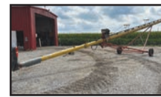
2008 WESTFIELD WR80-61 GRAIN AUGER , 8"x61", 7.5 hp Electric drive motor, nice auger, S: 16916