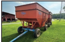
KILLBROS 350 GRAVITY WAGON , 10 TON GEAR, 11L-15 TIRES