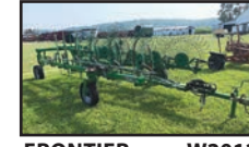
FRONTIER W2012E RAKE 12 wheel carted, kicker;