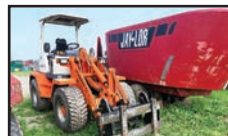
SCHAEFF SKL833 ARTICULATING FORK LIFT max weight 5400kg

Channell Equipment Urbana, OH Ashlyn Woodruff 937-206-3926 Gunner Weaver 937-727-9748