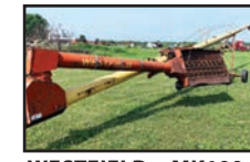
WESTFIELD MK100-61 SWING-A-WAY AUGER 540 PTO