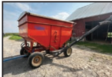
KILLBROS 350 WAGON SEED TENDER , roll tarp, Kill Bros 214 hyd. 14' Brush auger, 10 ton gear, 11L-15 tires