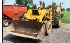
JD 500 LOADER BACKHOE , same as 3020 dsl, syncro trans., 6ft. loader bucket, 24" backhoe bucket, no leaks, solid machine.