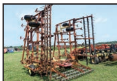
KRAUSE FIELD CULTIVATOR 4141, K-tine, field cultivator with coil tine harrow, rear hitch. S: 3360