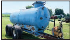
FIELD GYMMY MANURE TANK