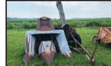
NEW IDEA 2 ROW PULL TYPE CORN PICKER