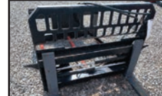
48" HYD. ADJ. PALLET FORKS, skid steer mount