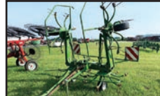
2005 KRONE TEDDER, 4 basket hyd. fold tedder, 540 PTO