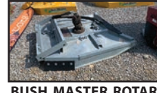
BUSH MASTER ROTARY CUTTER, 60"