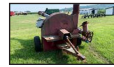
FOX SILAGE BLOWER