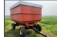
KILLBROS 400 CENTER DUMP GRAVITY WAGON , wood extension on J&M 1074 gear 12.5L-15, gears bought brand new & ex. cond. S: 4673