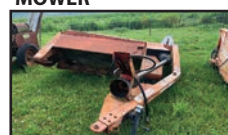
GEHL 2340 pull type discbine parts machine