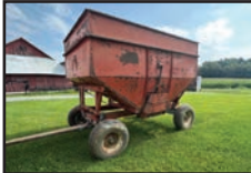
KILLBROS 350 GRAVITY WAGON , 10 ton gear, 11L-15 tires