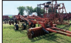
KRAUSE DOMINATOR 4850 12 ft. 7 shank w/rear condi. round bar reel. S: 110104/05