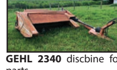
GEHL 2340 discbine for parts