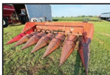
IH 863 CORN HEAD , 6 row 30", new end snout and hood, auger has been welded, works as it should. S: 0730101U030240