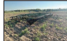
24' JOHN DEERE 235 DISK , hyd. fold, 7" spacing, rear hitch, tandem axle, 11L-14 tires, SN-019230A