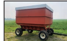
KILLBROS 400 CENTER DUMP GRAVITY WAGON , wood extension on J&M 1074 gear 12.5L-15, gears bought brand new & ex. cond. S: 4689