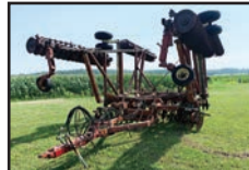
KRAUSE 2158 DISK, 40', disk, rear hitch, front left disk gang is damaged. S: 1301