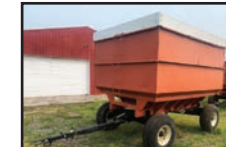
KILLBROS 400 CENTER DUMP GRAVITY WAGON , wood extension on J&M 1074 gear 12.5L-15, gears bought brand new & ex. cond. S: 1306655

For online bidding go to wilnat.com or equipmentfacts.com