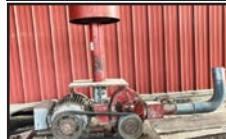
DMC 4" GRAIN TRANSFER SYSTEM W/air lock, 15 Hp Baldor motor, 6 hold distributor, 6 cushion boxes, approx. 300' of 4" pipe & various pipe connectors