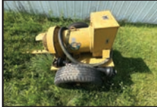
KATOLIGHT pto generator, 75KW