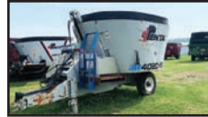
PENTA 4020-SD TMR MIXER wagon (2) SKID STEER MOUNT BALL HITCH MOVER

Channell Equipment Urbana, OH Ashlyn Woodruff 937-206-3926 Gunner Weaver 937-727-9748