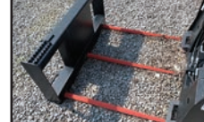
BALE SPEAR, 3 prong, skid steer mount

Call consignor for equipment questions and location of items.