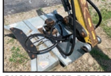
BUSH MASTER ROTARY BRUSH CUTTER, 42", hyd. drive, mounts to mini excavator boom.