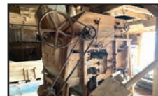
A.T. FERRELL & CO. MODEL 167D STATIONARY SEED CLEANER , Gustafson seed treater, 3 phase, 3 H.P., multiple screens from beans to grass seed, always stored inside, all augers included, manuals.