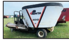
PENTA 3010 MIXER 540 PTO, scales