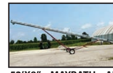
52'X8" MAYRATH AUGER , PTO top drive, poly hopper, hardly been used