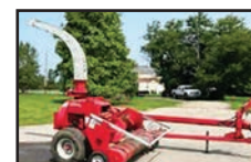
GEHL 865 PULL TYPE CHOPPER , comes with 5.5' hay head and 2R30" corn head, no control box, tires worn