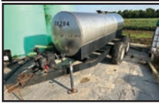
850 GAL. SS NURSE TRAILER , tandem axle, Briggs & Stratton eng., plumbing, hoses & valves. Used this spring.