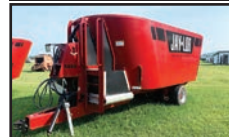
JAYLOR 5850 vertical TMR mixer wagon with front discharge