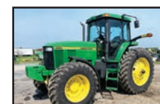
1998 JD 7710 Tractor , MFWD, 3788 hrs., 16/16 powerquad, 3 SCV, 480/80R42 rear duals, 420/85R28 fronts, RW7710H012347