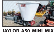
JAYLOR A50 MINI MIXER