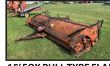
15' FOX PULL TYPE FLAIL MOWER