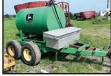
HOMEMADE FUEL TRAILER, Fuel trailer on tandem running gear with electric pump