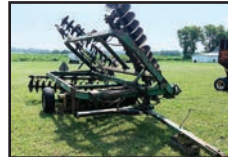
JD 220 DISK, hyd. fold