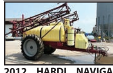
2012 HARDI NAVIGATOR 1000M PULL TYPE SPRAYER , 1000 gal. tank, 60' boom pull type, 3-way nozzle bodies, Hardi ctlr, rinse tank and hand wash tank. Foam markers do not work

Dan Koopmans Pleasant Plain, OH 513-315-1494