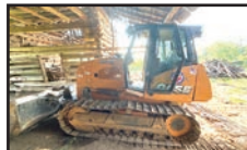
CASE 850 M WT DOZER , 1969 hrs., C/H/A, 6 way 10' blade, rear hitch, has had 2000 hour service. SN-NF-DC80091