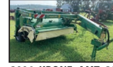
2004 KRONE AMT 283 CV MOWER