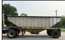
1973 21' FREUHAUF ALUMINUM HOPPER TRAILER , single axle, new roll tarp, air brakes, holds approx. 550 bu. SN-FRR524901