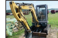
GEHL 383Z MINI EXCAVATOR cab, brush cutter sells separate. S:AE02213