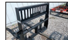
TITAN 42" PALLET FORKS