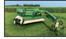
2012 KRONE EASY CUT 3200 discbine, rubber rolls, 2 pt hitch, 540 PTO