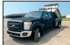
2011 FORD F-550 power stroke diesel crew cab, 4WD, 4x4, 11' bed w/dumper dog dump bed, stainless steel slide in dump bed, bed liner, 142,700 mi. Vin: 1FD0W5HT8BEB43614,

Dan Koopmans Pleasant Plain, OH 513-315-1494