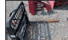
48" PALLET FORKS, skid steer mount