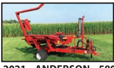
2021 ANDERSON 580 BALE WRAPPER, load arm