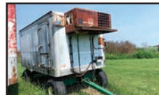
BADGER/MILLER PRO heavy duty running gear 14L-16.1 with Thermo King reefer body