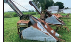
NEW IDEA 1 ROW PULL TYPE CORN PICKER