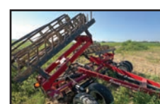
24' REMLINGER DOUBLE ROLLING BASKET , single bar harrow, hyd. fold, lights, SN-00010175, very little use