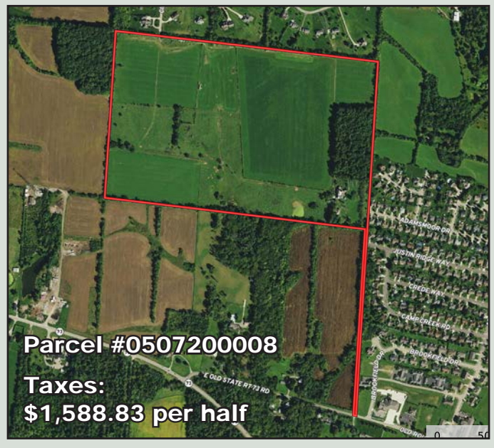
County access off Old SR 73 - Cierra Way - and potential village access off Adamsmore Drive

New Data, Corrections, and Changes: Please arrive prior to scheduled auction time to inspect any changes, corrections or additions to the property information.