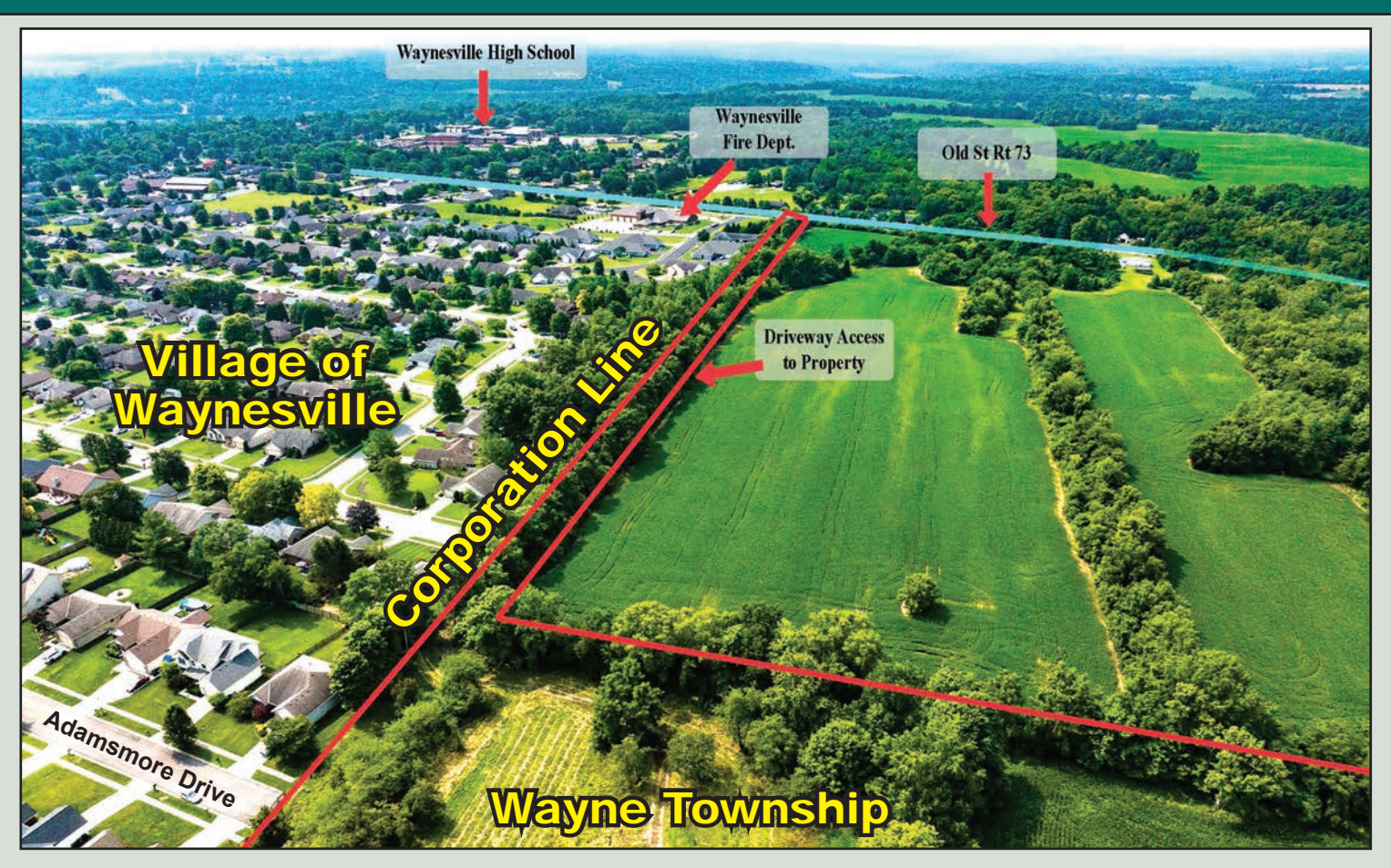
Adjacent to corporation limit & residential developments with water and sewer Zoned R-1 - Residence Single Family Zone Waynesville School District