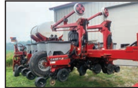
2009 Case IH 1250 12 row 30 inch planter , single disk fertilizer openers, hyd drive fertilizer pump, ground drive, single boxes, no-till, markers, no monitor