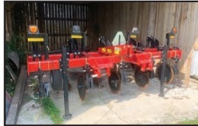
2020 CIH 2500 5 shank in line ripper , heavy duty springs, fall points less than 300 acre use