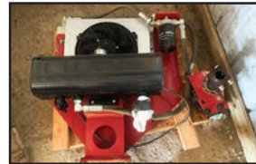
Case IH PTO hydraulic power unit , came off 1250 planter