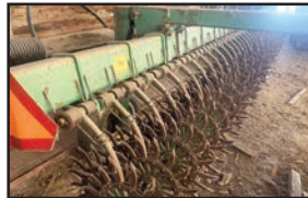
JD 400 20 ft rotary hoe