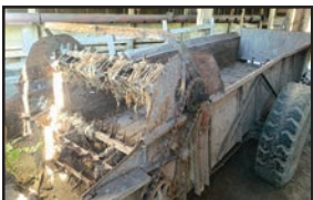
New Idea manure spreader , wooden floor, PTO drive, top beater