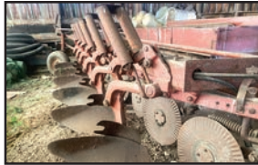
IH 720 5 bottom in furrow moldboard plow , auto reset