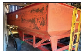
J&M 250 wagon with gear