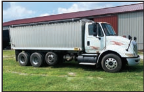
2007 International 8600 tandem axle truck , 560,756 miles with tag axle, 300Hp Cummins, 10 speed automatic, 11R22.5 tires, 2020 Kann 20 ft aluminum bed, roll tarp