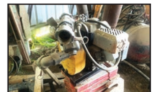
Monarch 2" cast pump with B&S engine