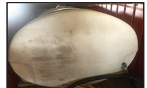
2000 gallon elliptical poly water tank