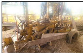
Vermeer model 12 pull type tile plow