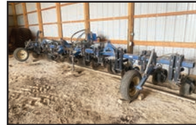
BluJet 11 shank anhydrous tool bar , Yetter Magnum single disk high speed openers, manifold with hyd shut off