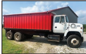
1995 Ford L8000 tandem axle truck , 301,320 miles, Cummins diesel, 20 ft. Omaha Standard stakeless bed, 60" sides, 11R22.5 tires, Eaton-Fuller 8 speed trans diff lock, roll tarp