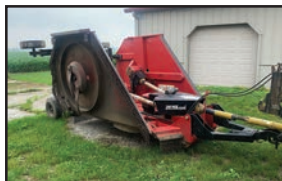
2012 Bush Hog 2615L "Leg-end" 15ft. Rotary cutter , 540 PTO, stump jumpers, front/rear chains, pneumatic tires on base, laminated tires on wings