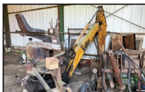
Kelly 3pt. backhoe