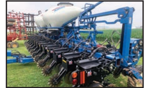
2017 Kinze 3500 ASD 12/24 split planter , mechanical drive, no-till, heavy duty down force springs, copper head spike closing wheels, scales, KPM III monitor 4,808 total acres