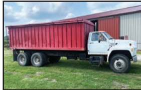
1989 Ford F900 tandem axle truck , shows 44,128 miles, 20 ft stakeless bed, Eaton-Fuller 15 speed trans, roll tarp