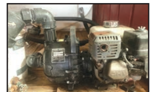
Pacer 2" pump with Honda engine