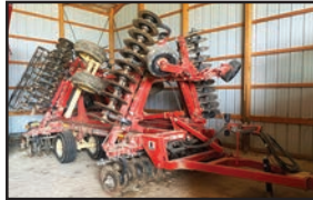
2012 Krause 8000 25 ft. Excelsior , star wheels with flat bar reel, low acres