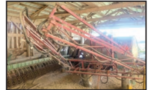
500 gal. Pull type sprayer , stainless tank, Century 45 ft. boom