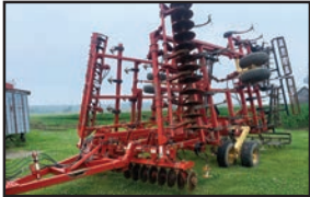
2010 Krause TL-6200 31 ft. Landsman , hyd adjust disk gang, K-tine, 3 bar-spike harrow with reel