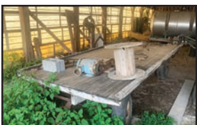
(2) 16 ft. Wooden hay wagons