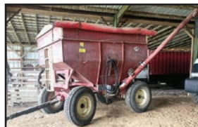
J&M 250 wagon , side extensions with J&M uni-swivel auger, 10.00-20 tires, tarp