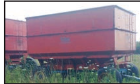
Killbros Transport 400, center dump gravity wagon