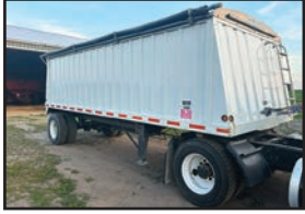
2014 Neville 22ft steel grain trailer