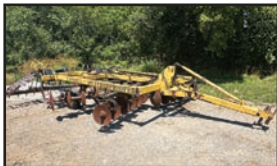
Landoli 5 Shank Ripper, adjustable disk gangs not hydraulic, 3 bar harrow, 9.5L-15 tires

James Craycraft 937-402-6031 Leesburg, OH