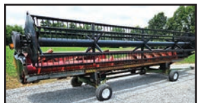
Case 1020 Grain Head , 25', field tracker, fore & aft reel, new cycle bar plus extra, rock guard w/J&M header cart. SN: JJCO316341