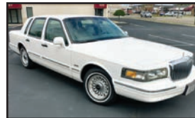
1997 Lincoln Town Car, 98k miles. Nice!

Dale Frenz Mt. Sterling, OH 614-519-4622