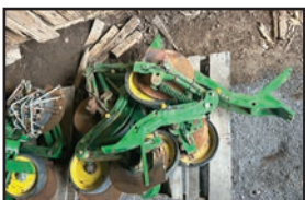
(16) JD single disk fertilizer openers off JD 1775NT