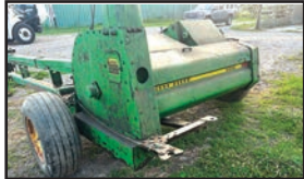
JD 3960 pull type forage chopper with JD 3 row corn head