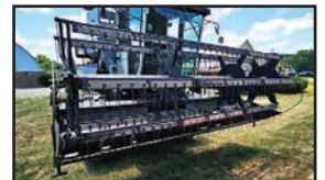
Allis Chalmers 13' grain head, SN: F-G60372F