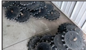
(32) Twister Closing Wheels

Oxford Township Jim: 740-272-1600 Ashley, OH