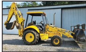
2000 New Holland 555E backhoe , technically 4wd, 4wd doesn't work only works 2wd, 16.9-28 rears, 14-17.5 fronts, 88" front bucket, 18" rear bucket, front fork attachment,

Foos/Furer Farm Bill: 937-537-6703 Richwood, OH