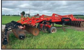
2014 Kuhn Krause 4850 9 shank Dominator mulch ripper, good blades and points, one owner