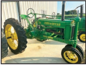
JD General Purpose