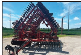
CIH 4200 33ft mulch tiller combo, tandems on base and wings, 5 bar spike harrow, rear hitch