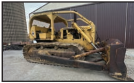
International TD25 Series C Dozer , 12' blade, works as it should, good undercarriage, SN: 360050U0002267

Allen Farms Gale Allen 937-760-5481 Lynchburg, OH