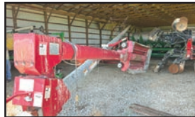
2008 Mayrath 62'x10' swing a way auger , good flighting with minimal use