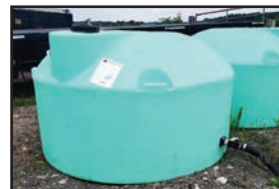
1000 gallon Snyder green poly tank