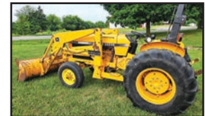
JD 2355 Tractor, 2,371 hrs., w/ 110 loader, tac not working, 1 remote, 540 pto, 3 pt., 2wd

Herb/Drew Summe Herb 513-406-8549 Drew 513-324-4836 Oxford, OH