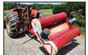
Kuhn ELHO-PAK Bale Wrapper, 20" wrap, new gears, good working condition, 3pt., up to 5' bales