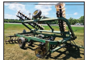
JD 235 Disc, 20", 2 new hydraulic cylinders, missing 3 discs

For online bidding go to wilnat.com or equipmentfacts.com