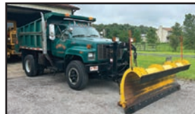
1994 Chevy Kodiak dump truck, 40,085 miles, CAT 3116 diesel, Allison automatic transmission, 9ft. Warren dump bed with auger spreader, 10ft snow blade with new cutting edge, 8ft. Sweepster hydraulic broom, fuel gauge not working

Oxford Township Jim: 740-272-1600 Ashley, OH