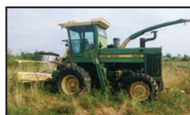
John Deere 5400 Forage Harvester, self propelled, RWA, 4RN cornhead, 7' hay head