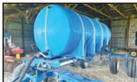
DuoLift 1000 gal fertilizer tank on hi clearance gear with (8) 12.5L-15 implement tires for 30" rows

Foos/Furer Farm Bill: 937-537-6703 Richwood, OH