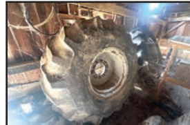
Tires & Wheels , 10 bolt rim, 28L-26 tires, stored inside