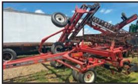
Unverferth 34ft. 220 double rolling basket with lift assist wheels