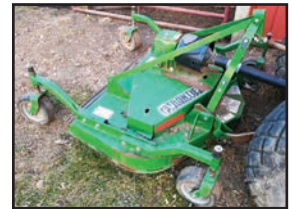
Frontier GM1060 3 pt finish mower

Dale Frenz Mt. Sterling, OH 614-519-4622