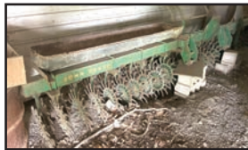
JD 400 rotary hoe