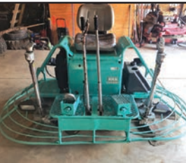
2001 Multiquip Whiteman Series Model HHN31VTCSL5 8' Ride on Trowel Machine, Twin Pitch Controls, 330 hrs., Briggs & Stratton Vanguard DM950G Liquid Cooled Gas Engine, Well serviced, works well

Allen Farms Gale Allen 937-760-5481 Lynchburg, OH