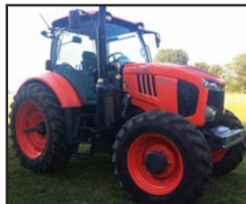
2021 Kubota M7-132 Deluxe 38.6 hrs. Cab with heat and air, air ride deluxe seat, buddy seat Transmission is 30 speeds with full power shift with auto mode Four wheel drive 18.4 x42 rears tires Front tires 14.9 x 30 Adjustable Bar axle Three rear remotes and 3 PT hitch PTO 540/540E & 1000/1000E

Ervin Burkholder 937-515-4919 Sardinia, OH