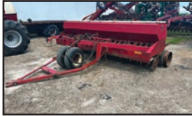
IH 620 15 ft. Press wheel drill, 7" spacing