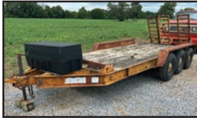
Hurst 18ft tri axle bumper pull trailer