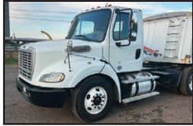
2017 Freightliner M2 112 single axle semi tractor, Cummins ISL9, 10 speed, cab suspension, air ride, 287,845 miles