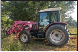
Mahindra 7010 with ML 170 front loader with forks and bucket , 350 hrs., cab, MFWD, new front tires, new water pump, new starter, rebuilt injection pump, 540 pto, 3 pt, 3 hydraulic remotes, SN: 7010Z0800298.

Roger Brunk 937-603-8100 West Alexandria, OH