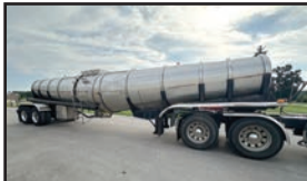
1990 Polar Drop Center 5600 Gal SS Tank Trailer , steel frame needs work, 11R24.5 tires, alum. outers, 3" elec. start Honda pump, front & rear finders. VIN: 1PMS14229L1010371