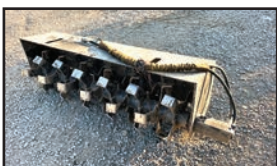
Skid Steer 6' Tiller