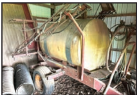
Century by Hiniker 500 gal pull type sprayer, hyd drive pump 40-45ft boom