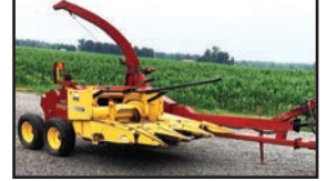
New Holland SP230 Forage Chopper

Clifford Whitmer 330-716-7055 Columbiana, OH