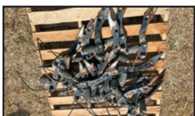
Precision Planting Concel parts 21 knives and 24 wheels