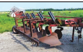
5 Bottom Case IH Plow