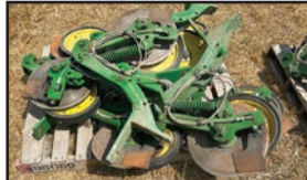
(16) JD single disk openers off JD1770NT planter