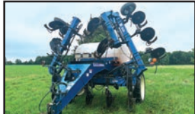
Blu Jet AT3000 15 knife 28% applicator, 1000 gal tank, 12.4-38 tires, John Blue ground drive pump, Fenning triple threat system, new coulters and plumbing