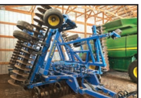
2012 Landoll 7431 33 ft VT plus Vertical Till , 21" blades, rolling basket, rear hitch with hydraulics