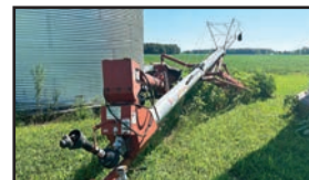
Mayrath/Hutchinson 62'x10" swing a way auger with power wheels on hopper

Clifford Whitmer 330-716-7055 Columbiana, OH