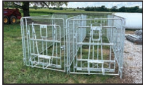
Calf Pens with bucket mounts, 75 - selling in 5 lots.

Larry Eby 717-504-3902 Washington C.H., OH