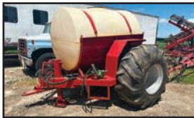
1000 gal homemade tow-between cart, 24.5x32 tires, Raven flow meter with 3 section valve, 3 IH style rear hyd outlet