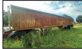
1989 Agri Hopper Trailer , 40' steel, commercial hoppers, roll tarp. SN: 20457

Ervin Burkholder 937-515-4919 Sardinia, OH