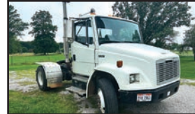
1999 Freightliner FL80 single axle semi tractor, 3126 CAT, odometer not working, new batteries, needs exhaust manifold gasket

Isler Farm Steve: 740-225-1927 Prospect, OH