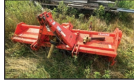
Mashio 7' 3pt tiller , 540 pto