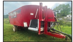
Jaylor 5600 TMR Mixer , tandem axles, Digi-Star scale, hyd. shoot, front left hyd. unload, 12.5L-15F1 tires, 540 pto

Gerald Reeves 937-689-9457 Winchester, OH