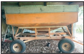
150 bu gravity wagon with wood sides, 9.5L-14 tires