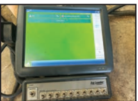
AgLeader Integra Monitor with switch box