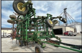
JD 2200 Field Cultivator , 44', trifold, walking tandem axles, front dolly wheels, 3 bar coil tine harrow. SN: N02200X000692