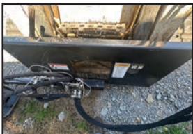
6' Wolverine Skid Steer Sickle Bar Mower, has hydraulic raise & lower, hydraulic drive