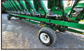
2018 Unverferth Header Cart , AWS, SN: 23196