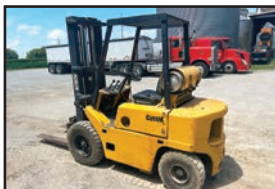
Clark C500-Y50 forklift, pneumatic tires, LP, hi-lo, 44" forks power steering leaks

For online bidding go to wilnat.com or equipmentfacts.com