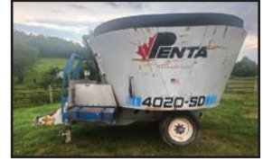
Penta 4020SD TMR Mixer , right front hyd. unload, hyd. shoot, 540 pto, Digi-Star scale, SN: 031114

Esquire Cattle Co. 330-204-4351 Dover, OH