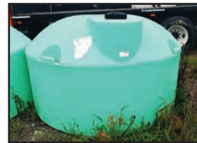
1000 gallon Snyder green poly tank