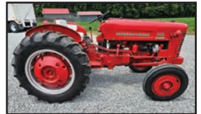
1966 IH 300 Tractor , gas, remote hyd., fast hitch draw bar and arms for 3 pt, new tires, radiator, and lights, front & rear wheel weights. SN: 903

Gerald Reeves 937-689-9457 Winchester, OH