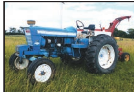
Ford 7000 Tractor, row crop model