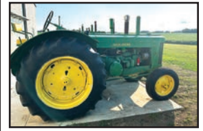
JD R Diesel

Craig Burkholder 419-234-2810 Bluffton, OH