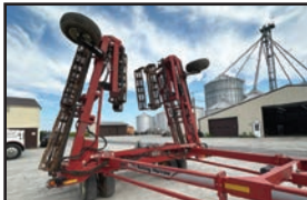
Unverferth 1225 Rolling Harrow , 45', tri folding, tandem axles.