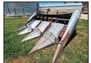
Allis Chalmers A-438 4 Row Cornhead