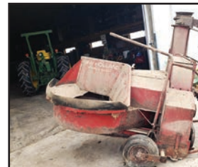
NH whirl a feed silage blower