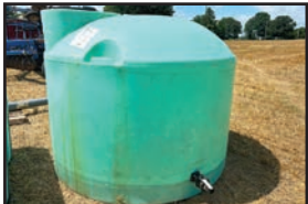
1600 gal Snyder green poly flat bottom tank