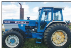
Ford TW-25 Tractor, Series II, FWA, 3300 original hrs., 20.8-38 Firestone rear tires, dual hubs, Firestone 20.8-38 duals on 10 bolt wheels

This will be a live auction held online. You can bid online, phone bid, or attend at offices of: Wilson National LLC 8845 SR 124 Hillsboro, OH 800.450.3440