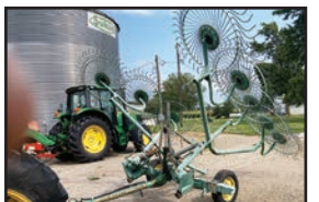
John Deere 702 Hay Rake , 10 wheel, hyd. fold, needs some work