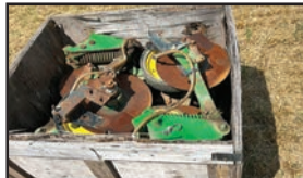
(24) JD single disk openers off JD 1790 20" planter