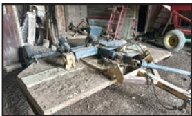
LandPride 10 ft. pull type rotary cutter, 540 PTO, stump jumpers