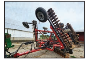
Case 330 Turbo Till, true tandem, 34ft., rolling basket