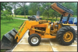
1989 Ford 445C loader tractor , 3,363 hours, diesel, 7ft. Bucket, 8 speed, hi-lo trans., left hand reverser, independent PTO, 3pt, aux hyd outlet