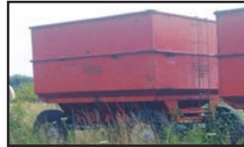
Killbros Transport 400, center dump gravity wagon