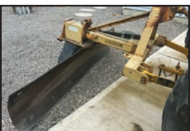
LandPride 35 7ft rear 3pt blade , skid pads