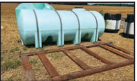
1600 gal. Blue poly Horizontal leg tank with frame