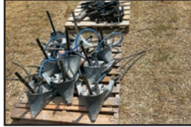
(9) Yield 360 Y drop side dress units for sidedress bar