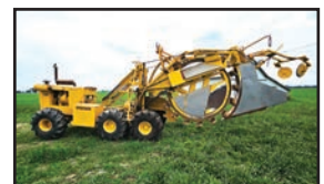
Speicher 7060 Ditcher, 6 wheel