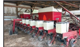
CIH 900 12 row cyclo air planter, dry fert, end transport, PTO pump, population monitor

BR&J Farm Mike: 740-251-3117 Marysville, OH