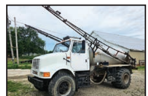
Navistar International Spray Truck, foam tank doesn't work, 60 ft., 1,300 gal. S.S. tank, DT 466 engine, ac doesn't work