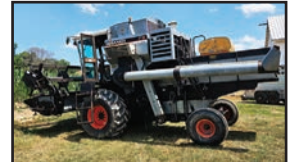
1984 Allis Chalmers Gleaner F3 Combine, unknown hrs., dashlights not working, new belts, new chains, newer auger, goodyear 23-126 fronts, goodyear, 11.00-16 rears