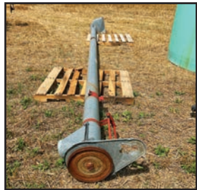
6"x20ft Hutchison auger