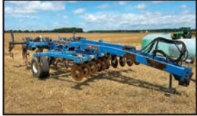
DMI 530B disk ripper, 5 shank 30 inch, rear hyd leveling disks