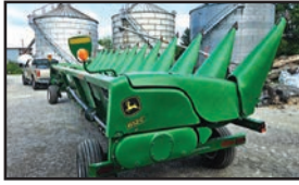
2012 JD 612 C 12 Row Corn Head , Row Sense, SN: 1H0061ZCECX746611