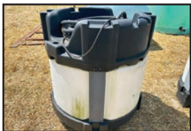
(3) 145 Gal. Chemical Shut-tles with pumps