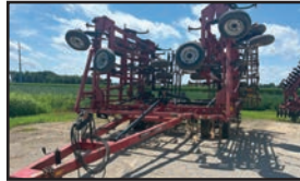
CIH Tiger Mate 200 48ft. Field cultivator, Remlinger 3 bar spike with rolling basket rear harrow, walking tandems on base and wings, main lift tube has been welded