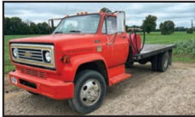
1976 Chevy C60 custom deluxe, 350 gas engine, 4 speed hi-lo, 14'x8' wood bed, fuel tank