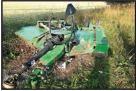
John Deere HX15 10' Rotary mower , hydraulic fold, front chain guards