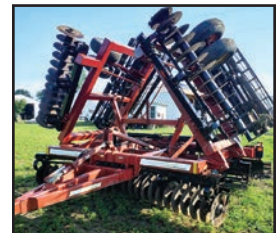
30' McFarlane 4030 Reel Disk, 19' blade, rolling basket, 3 bar harrow, tandem axle, SN: 12513

Darby Maple Farms LLC Mike Thrush 614-203-0838 Milford Center, OH