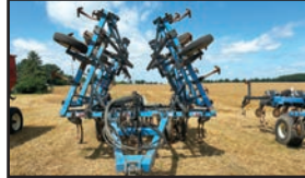
DMI Tigermate II 30 ft. field cultivator, 5 bar spike harrow with rear hitch and hydraulics