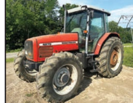
Massey Ferguson 4270 Tractor , cab, MFWD, 2,107 hrs., 3 pt, 540, 1,000 pto, 18.4R38 rear tires, 14.9R30 front tires. SN: F24363