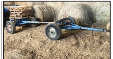
Kilbros Running Gear, Bean Brothers, 937-302-6543, Sabina, OH