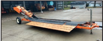
Batco PS2400 Drive Over Conveyor, like new. Stilwell Farms, 740-808-0971, Baltimore, OH