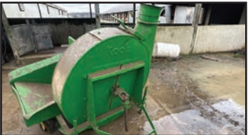
Kools grain/forage blower, Berry Farms LLC, 740-243-5040, Lancaster, OH