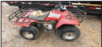
1988 Honda 300 fourtrax ATV ran fine but has bent axle Berry Farms LLC, 740-243-5040, Lancaster, OH