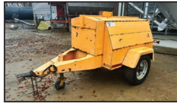
Gordon Smith 100cf Air Compressor, Ford eng, 100' hose & reel. Stilwell Farms, 740-808-0971, Baltimore, OH