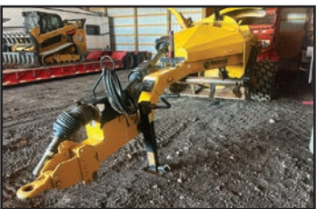
2019 Elmers Mfg. Wolverine Extreme Dirt Blower, 5' flat bottom, 1000 pto, updated paddles, liner & bearings, sells with GPS controllers. Rhoades Farm, 740-225-0654, Radnor, OH