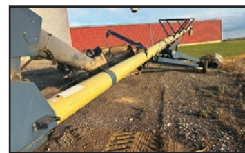
2013 Harvest International H1372, swing away auger, 13"x72', 540 pto, power hopper. Rhoades Farm, 740-225-0654, Radnor, OH