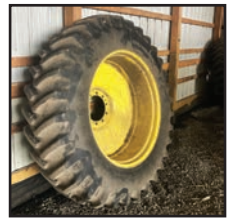
Firestone Duals, 480/80R42 w/10 bolt rims. Bean Brothers, 937-302-6543, Sabina, OH