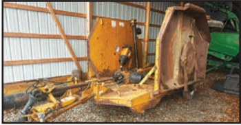
Woods 3180 15' Batwing Mower, 540 pto. Stilwell Farms, 740-808-0971, Baltimore, OH