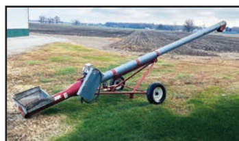
Hutchinson 32', 10" load out auger, electric drive with motor. Perry Acres, 740-404-0443, Ashley, OH