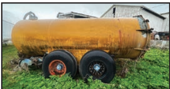
3,300 Betterbuilt Honey Wagon, pump works, tank has a couple small holes, 1000 pto, air plane tires Berry Farms LLC, 740-243-5040, Lancaster, OH