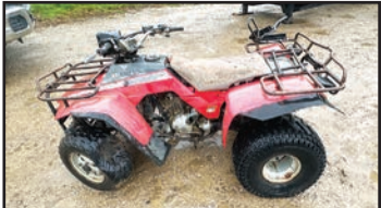
1987 Honda 250 fourtrax ATV for parts Berry Farms LLC, 740-243-5040, Lancaster, OH