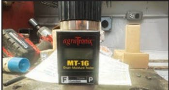
AgraTronix MT-16 grain moisture tester Berry Farms LLC, 740-243-5040, Lancaster, OH