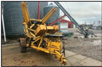
Vermeer TS44 Tree Spade, bumper hitch, Kohler eng. w/elec. start. Stilwell Farms, 740-808-0971, Baltimore, OH