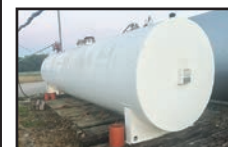
2012 Flameshield 4000 gal dual wall fuel tank with pump