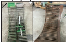
JD wheat inserts, round bar concaves out of JD S780