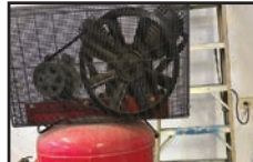
Husky Pro 80 gal two stage air compressor