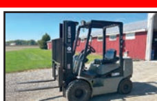
1996 Clark Forklift model CGP25, gas, triple mast, off pavement pneumatic tires, 5,000 lb lift capacity, updated service 5797 hrs