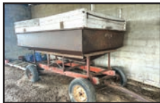
Killbros 100 bu gravity wagon