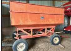
J&M 250 gravity wagon 9.5L-15 tires