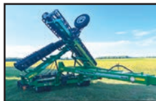
2024 Unverferth 1645D 45 ft working width, gooseneck hitch, 16" diameter basket & drum combo with lift assist wheels