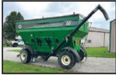
J&M 555 dual compartment gravity wagon with auger, tarp, fenders, 425/65R22.5