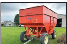
Killbros 385 gravity wagon on J&M gear 11R22.5 tires