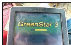
JD 2630 display AutoTrac, Section Control 1,556 hours