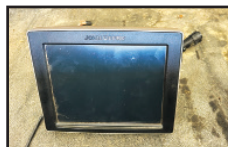
JD 4640 display with AutoPath, AutoTrac, AutoTurn, Implement Guidance, Machine Sync, Rowsense, Section Control activations 362 hours