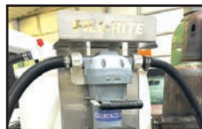
Fill Rite 8 gpm DEF pump