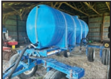
Duo Lift 1000 gal pull behind nurse trailer