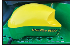
JD 6000 GPS receiver SF3 enabled until 05-03-2027 2072 hrs