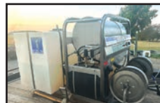
HydroTek portable pressure washer , 200 gal tank, B&S engine