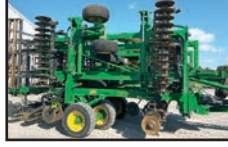
2020 JD 2660VT 43 ft 6 inch, vertical till, TruSet, VF445/50R22.5 tires, knife bar conditioning reel, rear hitch