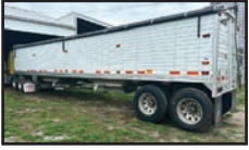
2012 Timppte 40 ft aluminum ag hopper trailer , spring ride, aluminum wheels, tarp