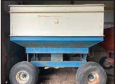
DMI 300 gravity wagon