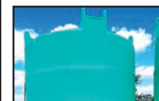
(2) Snyder 3,000 gal. Green Vertical poly tanks used for fertilizer