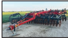
2019 CIH 875 Ecolo Tiger disk ripper , 11 shank, covering disk and hydraulic reel, 440/55R18 tires, less than 1000 acres