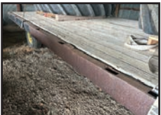
18' Flatbed Wagon