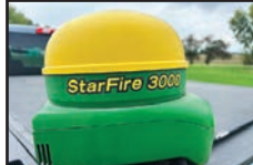
JD 3000 GPS receiver , 6024 hrs