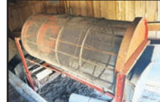
Rotary grain cleaner