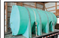
3,000 gal. Green horizontal leg tank used for water