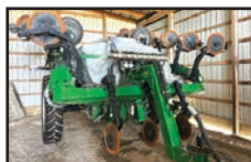
2022 Unverferth Nutri-max 1800 17 knife fertilizer applicator , 14.9R46, chemical inductor, JD rate controller, only used on 420 acres