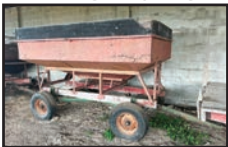
100 bu gravity wagon on JD gear