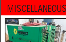
2012 Sullivan Palatek Portable diesel air compressor , model D185, JD diesel engine 637 hrs.