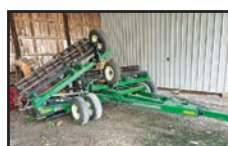
Unverferth 1225 35 ft double rolling basket, diagonal leveling bar, lift assist wheels