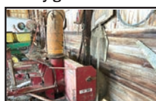
George White 7 ft 3pt snowblower