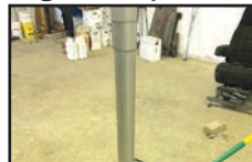
Emerson 12T pneumatic sprayer jacks