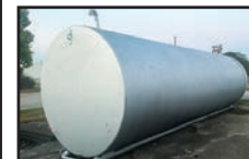
10,000 gal. Single wall fuel tank with pump