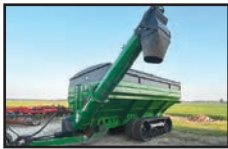
2017 Brent 1596 grain cart , 42"x148" Equalizer tracks, 1 3/4" PTO, scales, AutoLube one owner