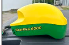
JD 6000 GPS receiver , 4268 hrs