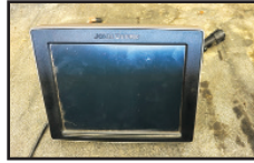
JD 4640 display with AutoTrac, RowSense, Section Control activations 458 hours