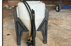
35 gal. Venturi style Induction cone