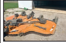
2019 Woods BW15.500 15 ft batwing rotary mower , stump jumpers, 1000 PTO, front/rear chains, pneumatic tires