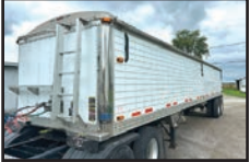
2008 Timppte 40 ft aluminum ag hopper trailer , spring ride, aluminum wheels, tarp