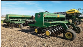
30' John Deere 750 drill , weigh scale, Houck hitch, progressive markers, brand new steel, 7.5" spacing, re-builds never been to the field, SN#N00750X022599