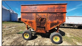
350 bu. Gravity Bed Wagon