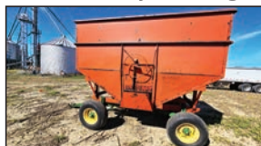
350 bu. Gravity Bed Wagon