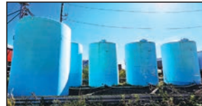
Quantity 5 - 5,000 gallon tanks , 3" plumbing