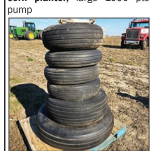
Stack of 6 implement tires