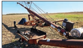
Hutchinson 850 8"x60' swing away , single phase elec. drive, hyd. raise & lower