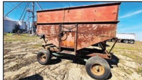
350 bu. Gravity Bed Wagon