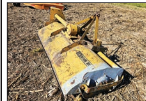
6' Bush hog flail mower , 3pt hook up, 540 P.T.O.