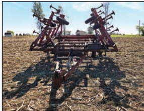
25' international 4600 field cultivator , hyd. fold, walking tandems