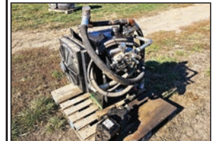
AKG hydraulic power unit for corn planter , large 1000 pto pump