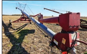
10x62 Hutchinson swing away auger , 540 pto, SN: 924652