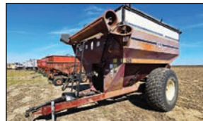
525 J&M 14" auger , roll tarp, 23.1-26 turf tires, big 1,000 PTO, SN#40033