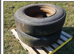
(2) R24 Bridgestone trailer tires