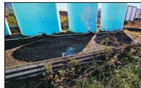
25'x48' chemical dykes , 2' tall