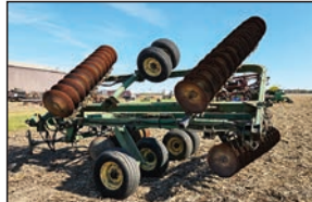
18' John Deere 220 disk , 9" spacings, hyd. fold, SN# 023515