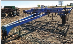
13" DMI pull type chisel plow , 9 shank