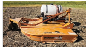
6' woods BB720 rotary mower , 3pt hook up, 540 P.T.O., with hydraulic driven spot sprayer attachment, SN# 10006514426014