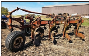
International 710 4 bottom plow , 4-16" bottoms, 2pt mount;