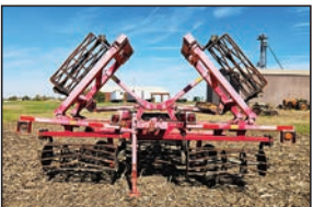
20' Sunflower single basket harrow , hyd. fold, SN# J0612568