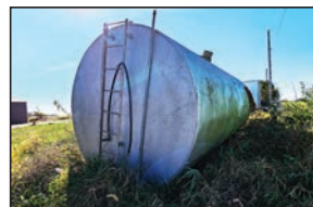
10,000 gallon steel water tank , 2" fitting