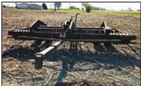
15' Brillion M164 Cultimulcher , SN: 86935