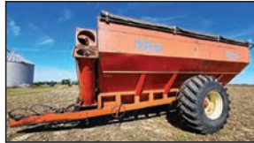
Killbros model 1600 grain cart , big 1,000 PTO, new augers, new bearings, roll tarp, 30.5L-32 tires