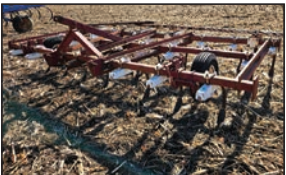
15' International Field Cultivator , 3 pt.