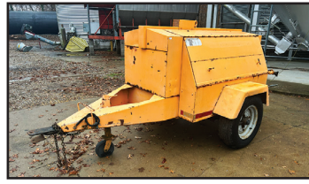
Gordon Smith 100cf Air Compressor, Ford eng, 100' hose & reel. Stilwell Farms, 740-808-0971, Baltimore, OH