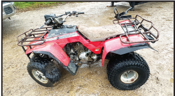
1987 Honda 250 fourtrax ATV for parts Berry Farms LLC, 740-243-5040, Lancaster, OH