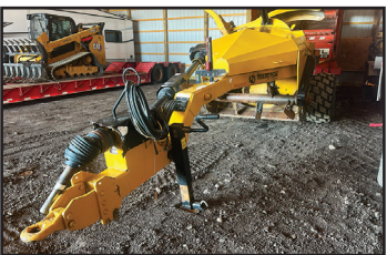
2019 Elmers Mfg. Wolverine Extreme Dirt Blower, 5' flat bottom, 1000 pto, updated paddles, liner & bearings, sells with GPS controllers. Rhoades Farm, 740-225-0654, Radnor, OH