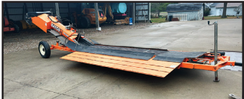
Batco PS2400 Drive Over Conveyor, like new. Stilwell Farms, 740-808-0971, Baltimore, OH