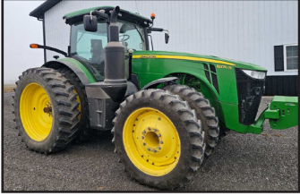
2014 John Deere 8370R, IVT, ILS, premium leather cab, premium lighting, 5 rear SCV outlets, 60 gpm pump, 3pt hitch, 4600 processor, Firestone tires, rear weights 3,500 hours. D&K Farms, 419-234-2810, Bluffton, OH