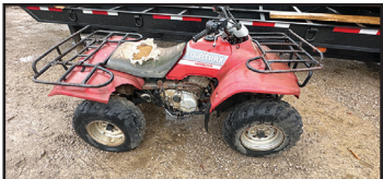
1988 Honda 300 fourtrax ATV ran fine but has bent axle Berry Farms LLC, 740-243-5040, Lancaster, OH