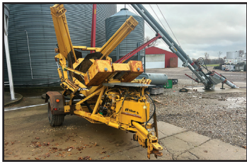
Vermeer TS44 Tree Spade, bumper hitch, Kohler eng. w/elec. start. Stilwell Farms, 740-808-0971, Baltimore, OH