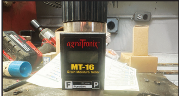
AgraTronix MT-16 grain moisture tester Berry Farms LLC, 740-243-5040, Lancaster, OH