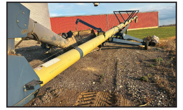
2013 Harvest International H1372, swing away auger, 13"x72', 540 pto, power hopper. Rhoades Farm, 740-225-0654, Radnor, OH