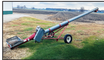
Hutchinson 32', 10" load out auger, electric drive with motor. Perry Acres, 740-404-0443, Ashley, OH