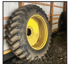
Firestone Duals, 480/80R42 w/10 bolt rims. Bean Brothers, 937-302-6543, Sabina, OH