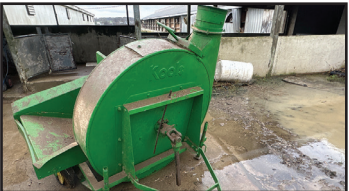
Kools grain/forage blower, Berry Farms LLC, 740-243-5040, Lancaster, OH