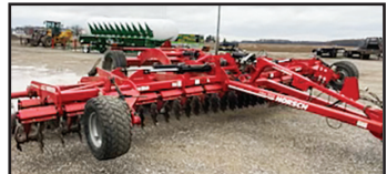
2017 Horsch RT25 25ft. Hi speed disk, wing gauge wheels with spring tine roll-flex finisher. Bahan Farms, Bradley 937-707-5635, Mt. Victory, OH