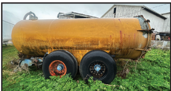
3,300 Betterbuilt Honey Wagon, pump works, tank has a couple small holes, 1000 pto, air plane tires Berry Farms LLC, 740-243-5040, Lancaster, OH