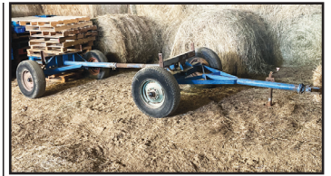
Kilbros Running Gear, Bean Brothers, 937-302-6543, Sabina, OH